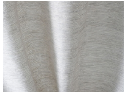
Li likes local mohair