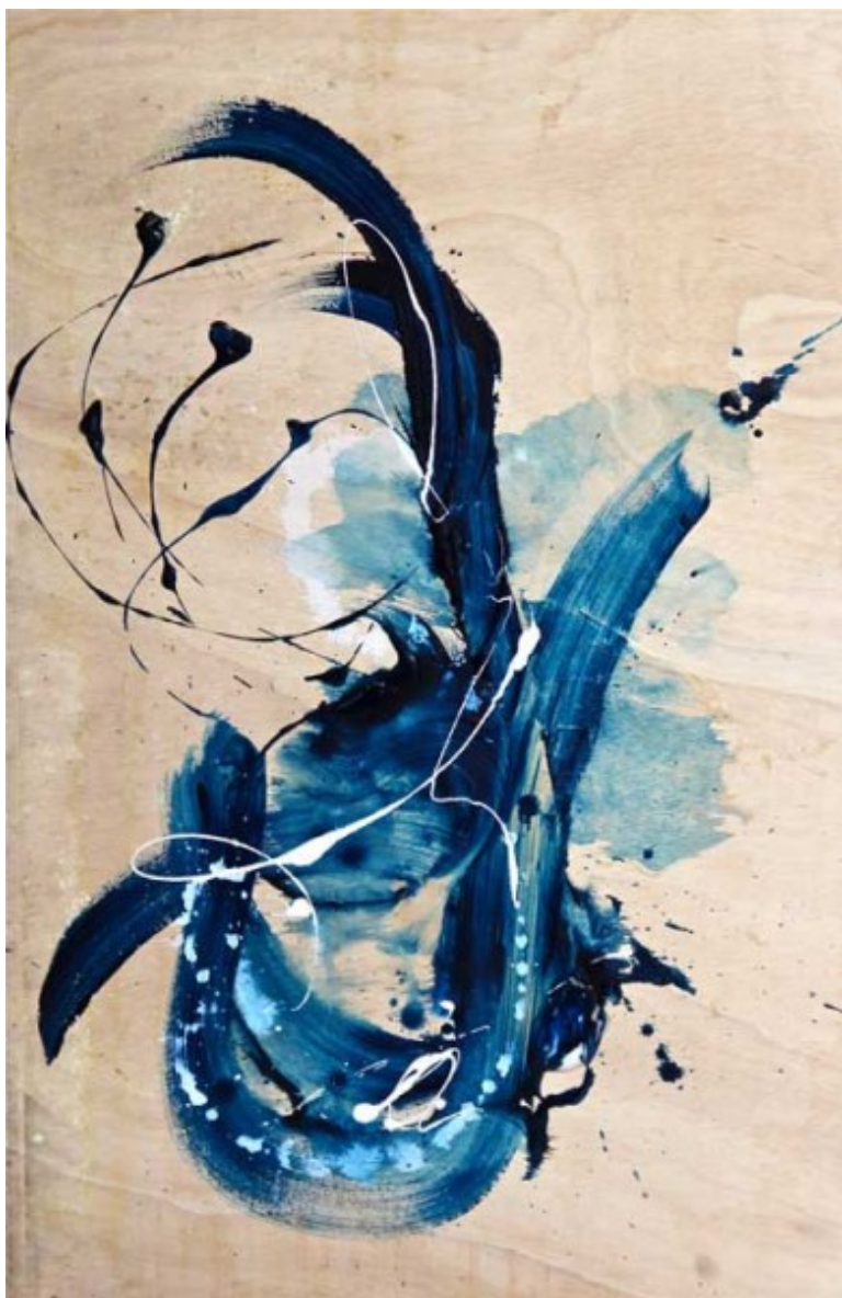
Untitled. pigment, acrylic on wood panel © Conor McCreedy

My roots are very much embedded in the African soil and I believe if you are born in Africa, it never leaves your soul. But the excitement of living in a place like Manhattan is just exhilarating and adds a different dimension to my creative spirit.