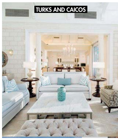
TURKS AND CAICOS