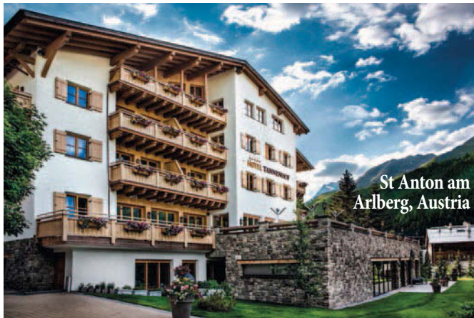
St Anton am Arlberg, Austria

ST ANTON AM ARLBERG, AUSTRIA: Just a hop away from either Innsbruck or Zurich (over the Swiss border), the über-exclusive Hotel Tannenhof's detox heaven awaits amid picture postcard-pretty Tyrolese scenery. Try treatments such as wraps and Silverquartzite massages, interspersed with alpine hikes, skiing on the back country or groomed slopes and yoga. www.hoteltannenhof.net/en