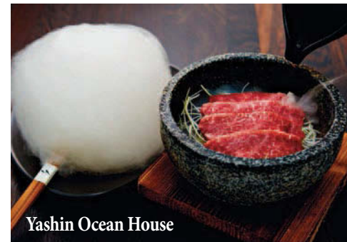
Yashin Ocean House