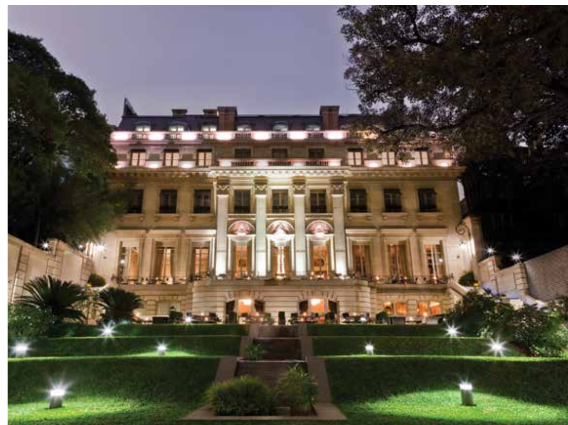
OPPOSITE PAGE: House of Jasmines' vast open spaces make it a great place for relaxation; Llaolao Hotel is surrounded by incredible natural beauty. THIS PAGE: Park Hyatt Buenos Aires is located in an old palace