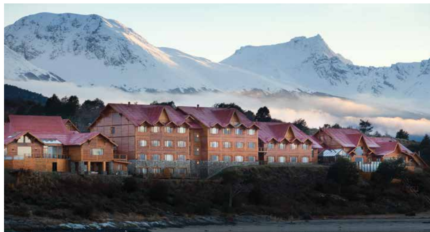
OPPOSITE PAGE: The Faena Spa is an oasis of holistic therapies. THIS PAGE: Los Cauquenes Resort & Spa offers private access to the Beagle Channel Beach; immerse yourself in the healing power of water at Correntoso Lake & River Hotel